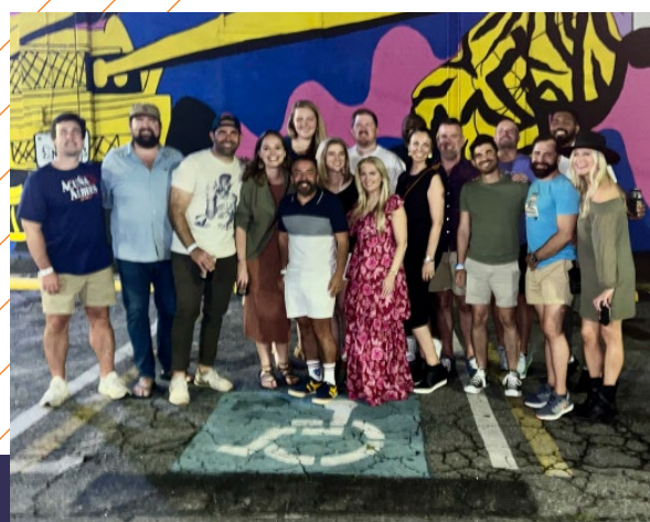
Young Professionals Board